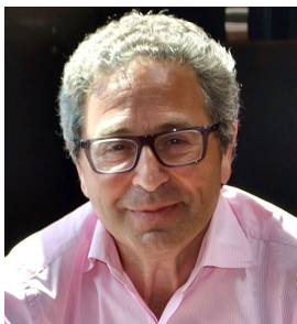
Chair of the Board Hockey Canada 2024